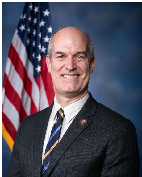
Rep. Rick Larsen (WA-02) Click here for headshot